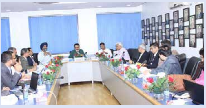
▲ Meeting of Advisory Committee on Service Providers held on 21<sup>st</sup> February, 2017.