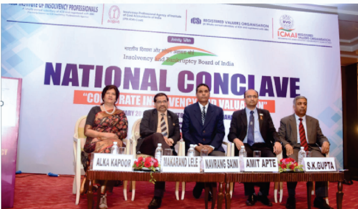
National Conclave on Valuation in Pune on 8 th January, 2019