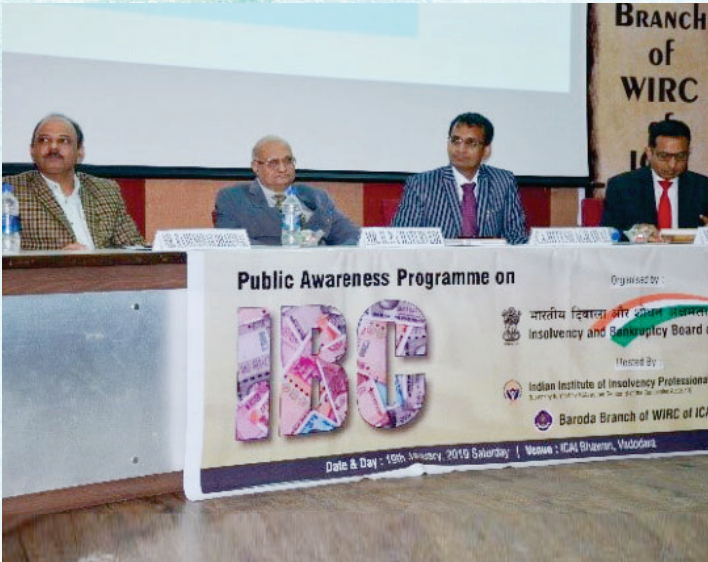
Awareness Programme in Vadodara on 19 th January, 2019