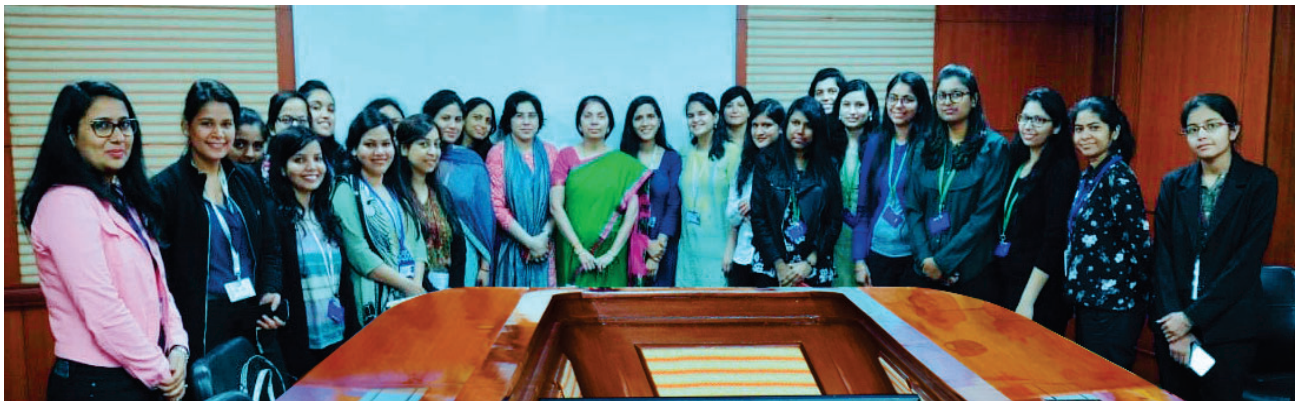
Women's Day, 8 th March, 2019

-Hon'ble Finance and Corporate Affairs Minister on 'Two Years of Insolvency and Bankruptcy Code (IBC)', Facebook, 3 rd January, 2019