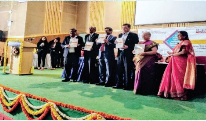
International Conference in Hyderabad on 1 st to 3 rd March, 2019