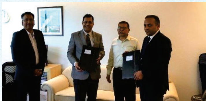
IBBI signs MoU with SEBI on 19 th March, 2019

It envisages (a) sharing of information and resources, (b) periodic meetings to discuss matters of mutual interest, (c) cross-training of staff, (d) capacity building of IPs and FCs, and (e) enhancing level of awareness among FCs.