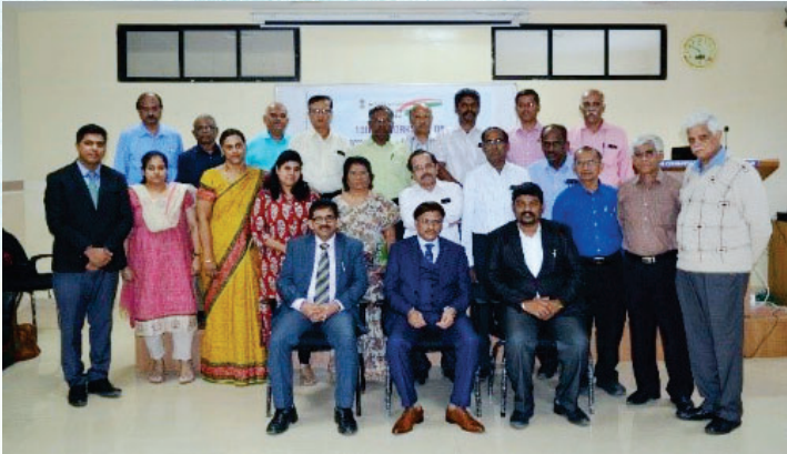
13 th Workshop for IPs in Coimbatore on 1 st - 2 nd February, 2019

IBBI has been organising two-day workshops for the newly registered IPs, with a view to build their capacity. During the quarter, IBBI organised two such workshops, the 13 th and 14 th in the series. The 13 th workshop with 23 IPs was held on 1 st - 2 nd February, 2019 at Coimbatore. The 14 th workshop with 27 IPs was held on 8 th - 9 th March, 2019 at Kolkata.