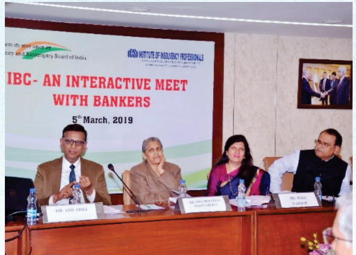
Interactive Meet with Bankers in Delhi on 5 th March, 2019