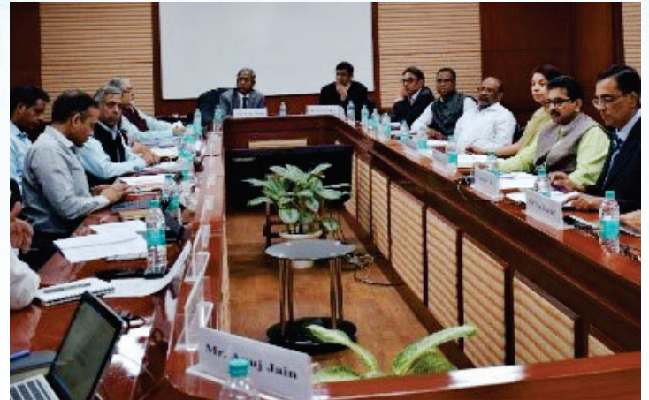
Meeting of the Working Group on Group Insolvency on 26 th March, 2019

The IBBI constituted a WG on Group Insolvency under the Chairmanship of Mr. U. K. Sinha, former Chairman, SEBI on 17 th January, 2019 with a mandate to submit a report recommending a complete regulatory framework to facilitate insolvency resolution and liquidation of CDs in a group.