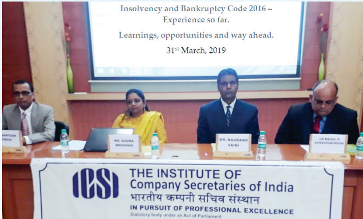
Insolvency and Bankruptcy Code, 2016 – Experience so far: Learnings, opportunities and way ahead held on 31 st March, 2019