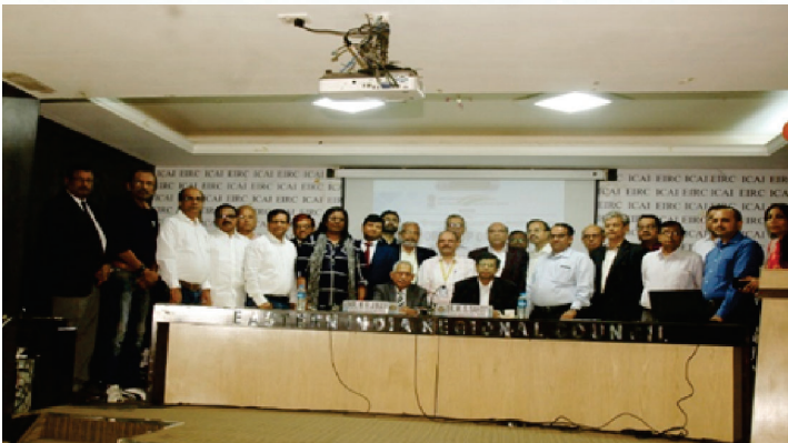
14 th Workshop for IPs in Kolkata on 8 th - 9 th March, 2019