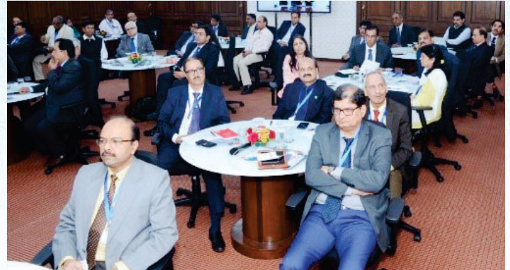
Workshop on "Committee of Creditors: An Institution of Public Faith" on 15 th and 16 th February, 2019

The IBBI, jointly with the State Bank of India and the Indian Institute of Corporate Affairs, organised a two-day workshop on "Committee of Creditors: An Institution of Public Faith" on 15 th - 16 th February, 2019 in Mumbai. The workshop was unique and first of its kind for the benefit of the FCs. 28 senior officers (General Managers and Executive Directors) of major scheduled commercial banks participated in the workshop.