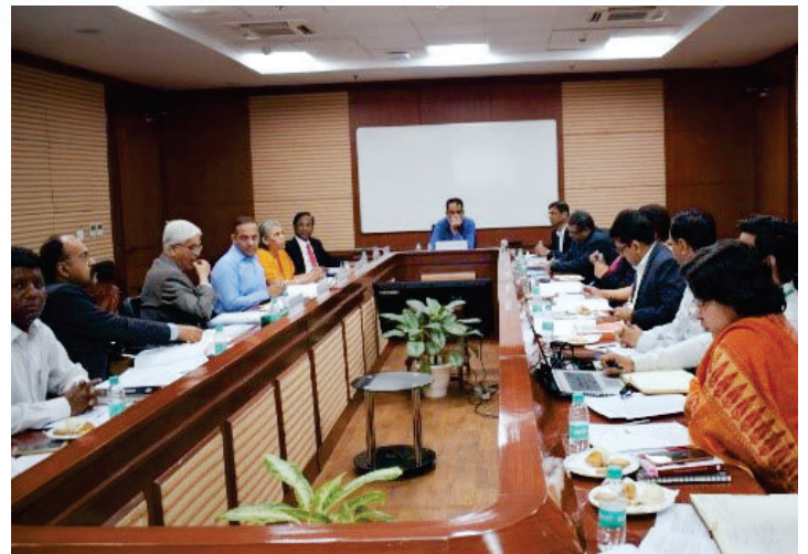
Meeting of Advisory Committee on Service Providers on 14 th March, 2019