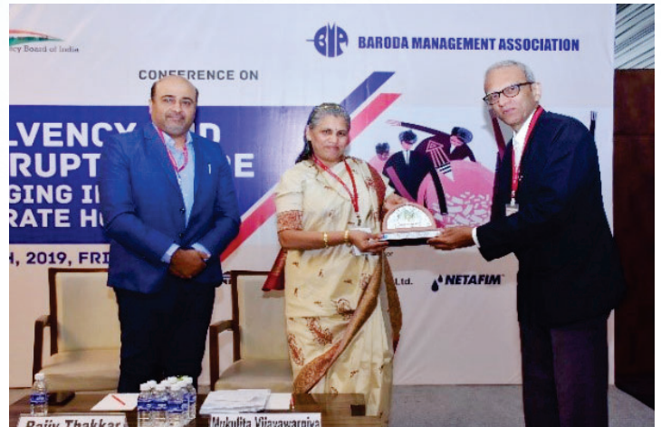
IBBI – BMA Conference in Baroda on 8 th March, 2019

In association with IBBI, the Baroda Management Association organised a conference on Insolvency and Bankruptcy Code in Baroda on 8 th March, 2019 on the theme “Changing Indian Corporate Horizon”. Distinguished professionals participated in this conference.