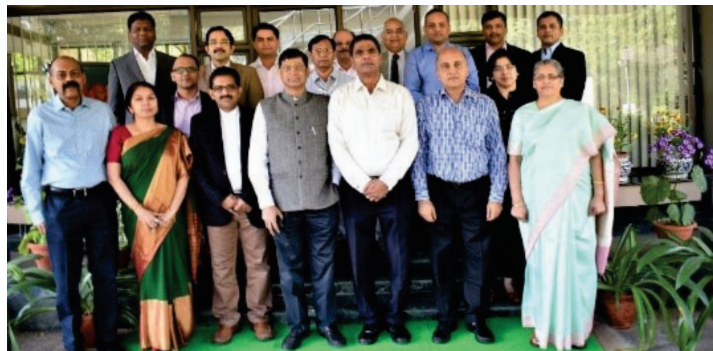
At Strategy Meet in Gurugram on 22 nd -23 rd March, 2019

The IBBI organises an annual Strategy Meet for formulating a strategic action plan to guide its efforts and resources towards its objectives. Senior officers participated in the third strategy meet on 22 nd and 23 rd March, 2019 at The Energy and Resources Institute RETREAT in Gurugram to formulate the Strategic Action Plan for 2019-20 that outlines its objectives, strategies, specific actions and tasks.