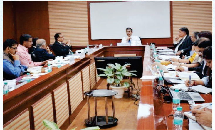
Advisory Committee meeting on Corporate Insolvency and Liquidation on 19 th March, 2019

The Technical Committee on IUs met on 5 th March, 2019. The Advisory Committee on Service Providers met on 14 th March, 2019. The Advisory Committee on Corporate Insolvency and Liquidation met on 19 th March, 2019. They deliberated various issues relating to processes and services under the Code.