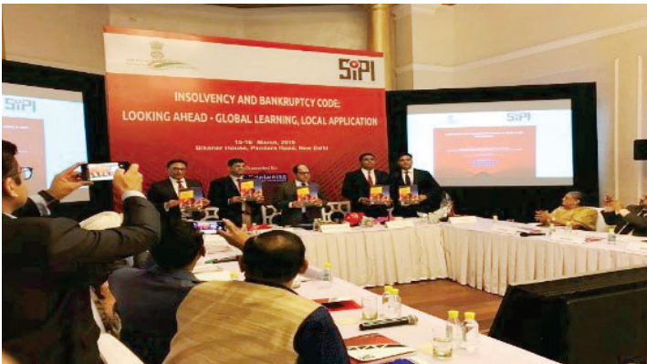
IBBI- SiPI Roundtable, 15 th March 2019