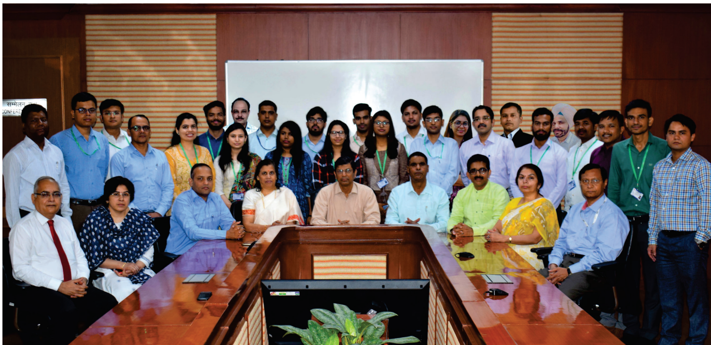
Chairperson, Whole Time Members and Officers as on 31 st March, 2019