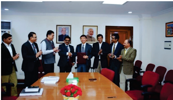
IBBI signs Cooperation Agreement with IFC on 6 th March, 2019