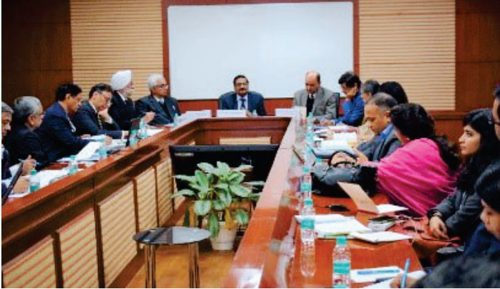
Roundtable on Liquidation in Delhi on 27 th February, 2019