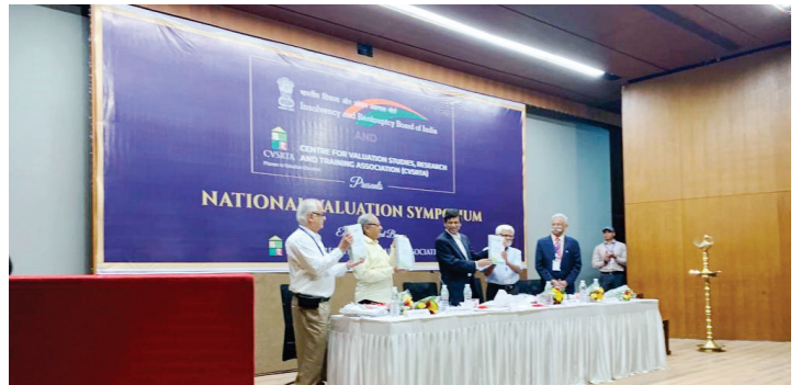
National Valuation Symposium in Ahmedabad on 23 rd February, 2019