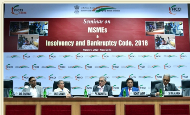
Seminar on MSMEs & IBC at New Delhi, March 6, 2020

Disclaimer: This Newsletter is meant for the sole purpose of creating awareness and must not be used as a guide for taking or recommending any action or decision, commercial or otherwise. The reader must do his own research or seek professional advice if he intends to take any action or decision in any matter covered in this Newsletter.