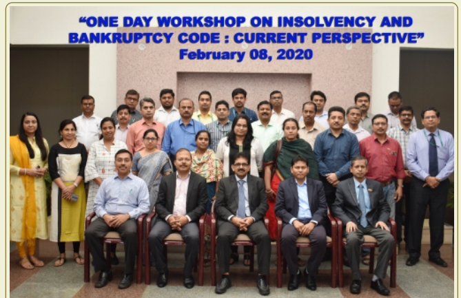
6 th Advanced IP workshop at Hyderabad, February 7 - 8, 2020