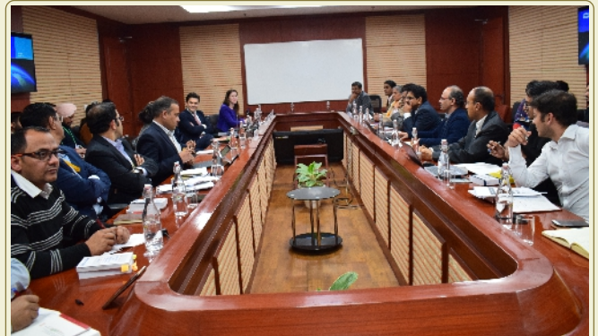
Workshop on Cross Border Insolvency, January 20, 2020