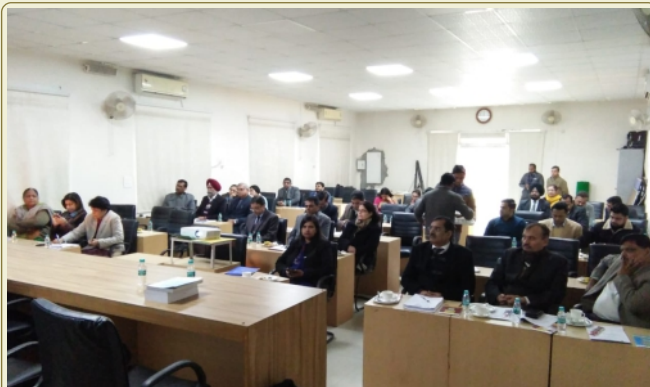
Awareness programme for income-tax officers at Ludhiana, January 9, 2020