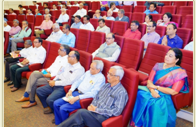
Workshop on Insolvency and Bankruptcy of PGs to CDs at Hyderabad, January 25, 2020