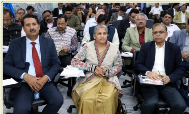
Colloquium on Insolvency and Bankruptcy process of PGs to CDs at New Delhi, February 29, 2020