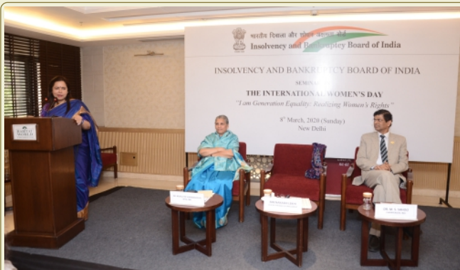
Ms. Meenakshi Lekhi at the Seminar on International Women's Day, March 8, 2020

Ms. Lekhi emphasised the convergence of virtues in a woman to restructure and manage social and personal relationships; and to further the objectives of the IBC to resolve stressed assets rather than liquidating the same. Citing examples of permanent commission in the armed forces, she pointed out that genderisation of the society has proved to be a failure.