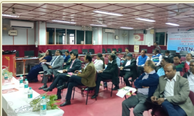
Awareness Programme at DRT Patna, February 22, 2020