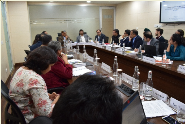
Meeting of the Committee on Cross Border Insolvency, February 7, 2020