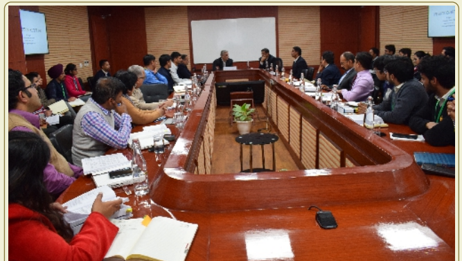
Workshop on Enforcement, January 23, 2020