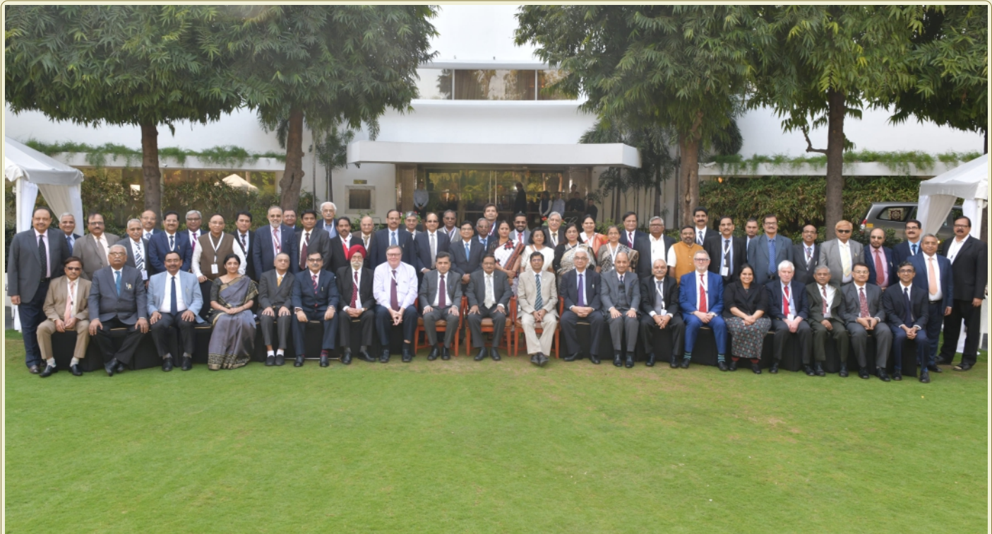
NCLAT and NCLT Colloquium at New Delhi on March 7, 2020