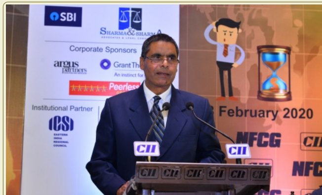
CII Conference in Kolkata on February 28, 2020