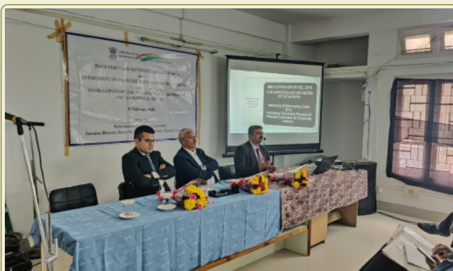
Awareness Programme at DRT Guwahati, February 1, 2020

With a view to increase the awareness on the newly notified rules and regulations for personal guarantors to CDs with effect from December 1, 2019, IBBI, in association with the Department of Financial Service, organised workshops at various locations across the country for officials of the Debt Recovery Tribunals (DRT) and Debt Recovery Appellate Tribunals (DRAT) during the last quarter. In the quarter January-March, 2020, two such workshops for the members and officers of DRT of Guwahati, Siliguri, Ranchi and Patna were organised at Guwahati and Patna on February 1, 2020 and February 22, 2020 respectively.