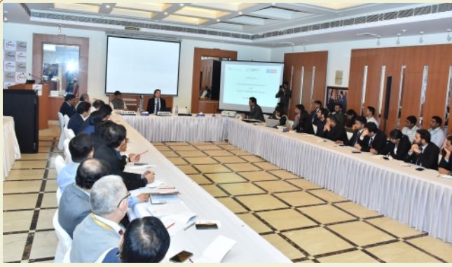
Workshop on Cross Border Insolvency, March 4, 2020